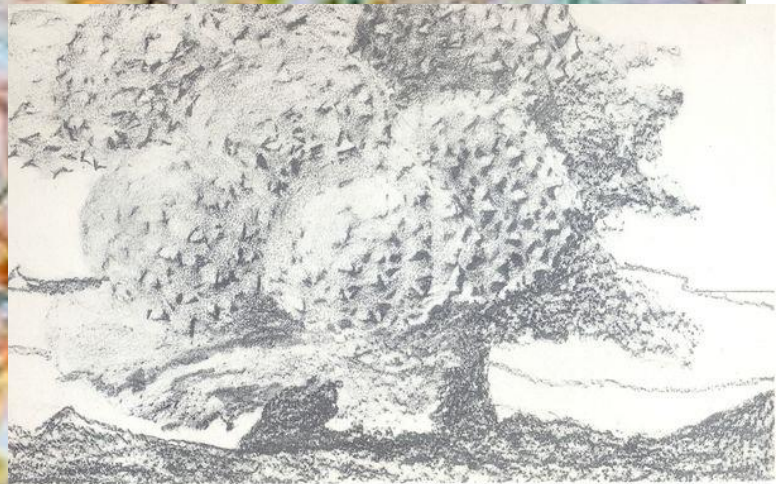
Surrealist frottages by max Ernst